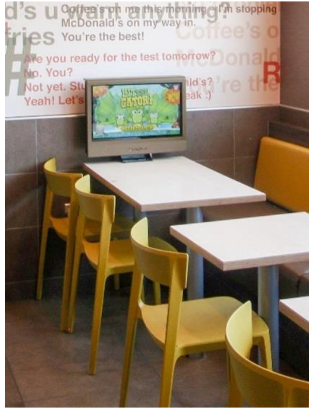
Here we see units mounted at standard tables – one is wall mounted and one is table mounted.