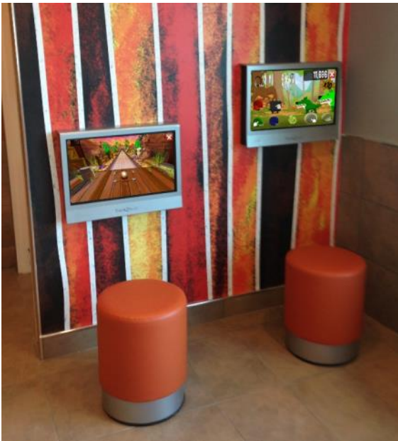
2 different mounting heights to accommodate different ages

There are numerous ways that Kidzpace products can be added to the décor of either the Dining Area or the Play Place. No matter where they are located they will enhance your customer's visit and give them a reason to choose your establishment the next time.