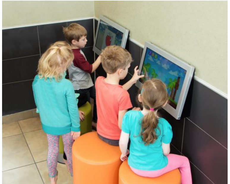
Shown is 2 Touch2Play Max units wall mounted.